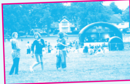
Jamaican and Caribbean food by Cummin Up + more food stalls to be confirmed.